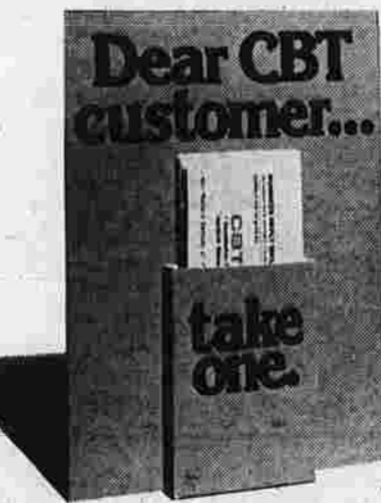
Pick up your postage-paid copy of our consumer questionnaire at any of our 64 offices.

CBT THE CONNECTICUT BANK AND TRUST COMPANY