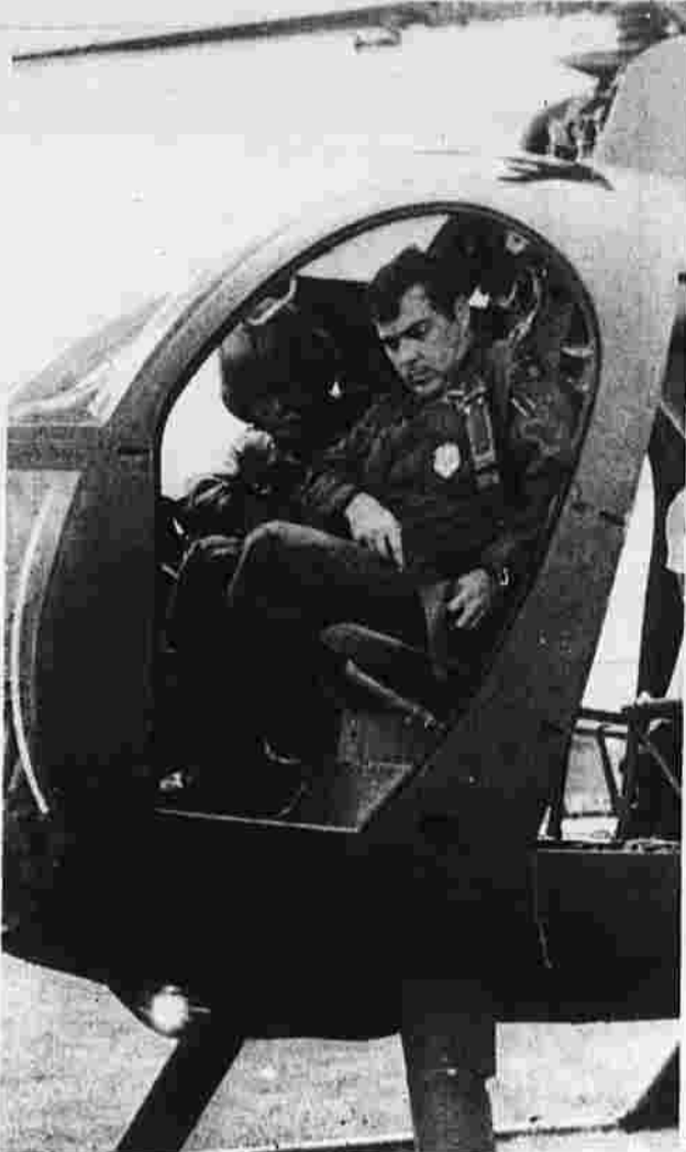
Summer Camp Mission